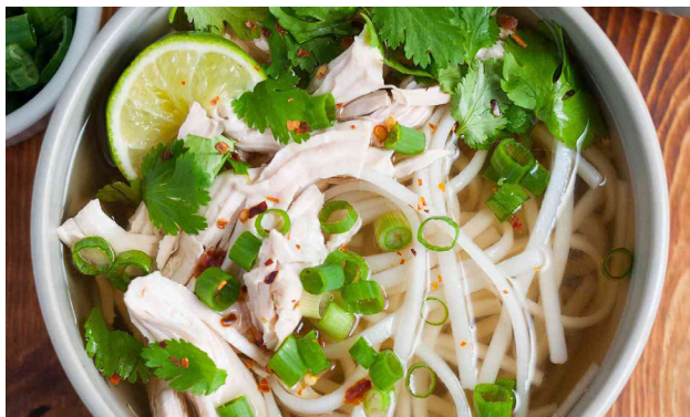
Vietnamese Chicken Noodle Soup - Pho Ga