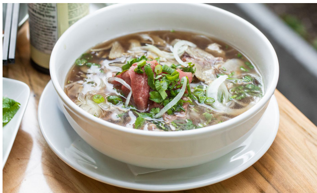
Vietnamese Beef Noodle Soup - Pho Bo