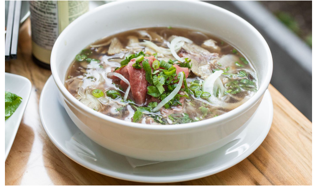
Vietnamese Beef Noodle Soup - Pho Bo