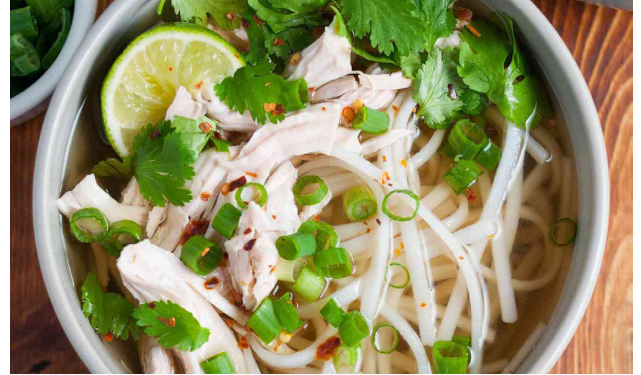
Vietnamese Chicken Noodle Soup - Pho Ga